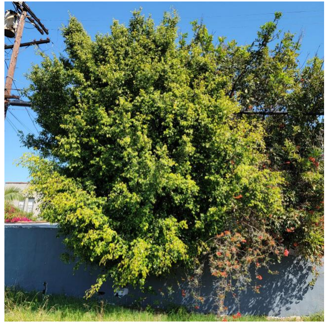
These photos show the plant material overhanging from properties to the east.