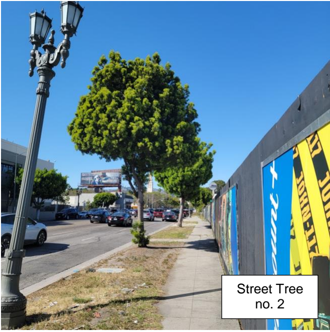
Street Tree no. 2