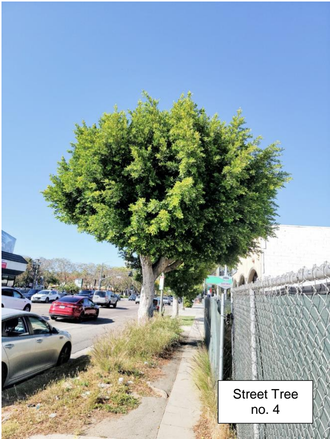
Street Tree no. 4